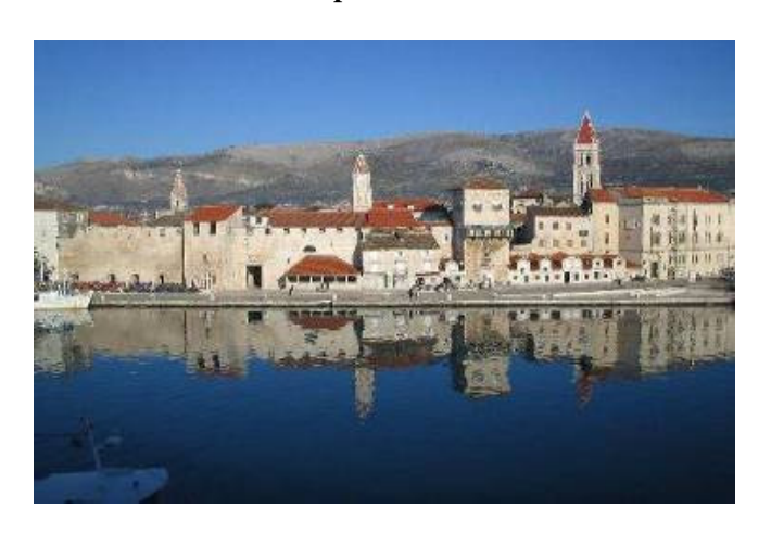
DAY 5 - Split - island of Korcula

Today we will visit the magnificent cathedral of Sibenik - St Jakov, monument of UNESCO. Next stop is the harmony of town called Trogir. The old part of the city is the haritage of UNESCO and is real treasure of art, remaisance buildings and little churches from the baroque period.