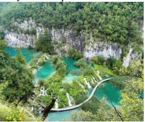
DAY 3 - National Park - Krka

Discover the world famous national Park. In the midlle of the forest, walk around 16 lakes, and you will feel like being in a fairytale walking around its spectacular waterfalls. National Park of Plitvice was proclaimed a world heritage site under protection of UNESCO in 1979