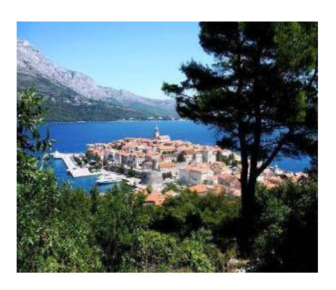
DAY 7 - Dubrovnik

Today we will also visit the little museum hidden in the village situated in the interior of the island. We will meet local people and sample the local drinks produced by them. Afterwords we will have lunch in the southern part of the island. The local family has a little restaurant in the midlle of "nowhere" - they will serve us produce from the garden and we will taste home produced olive oil.